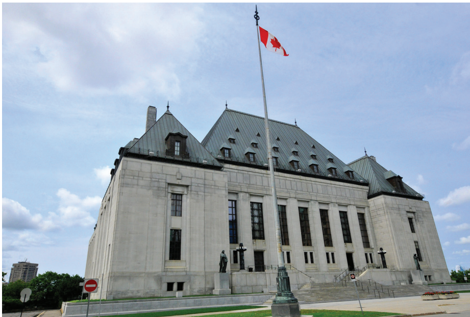
Figure 1.3 The Supreme Court of Canada

The Supreme Court of Canada is the highest level of the judicial branch of government.