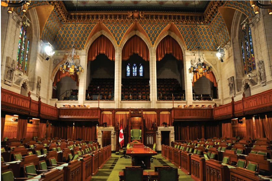
Figure 1.1 Canada's Parliament

The House of Commons in Ottawa is where democratically elected officials debate and vote on statute law as part of the legislative branch of government.